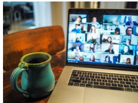
Dinner & Discussion Thursdays - June 15 to August 3

FINDINGS TO BE SHARED SOON! THANKS FOR PARTICIPATING