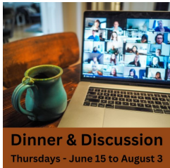
Dinner & Discussion Thursdays - June 15 to August 3